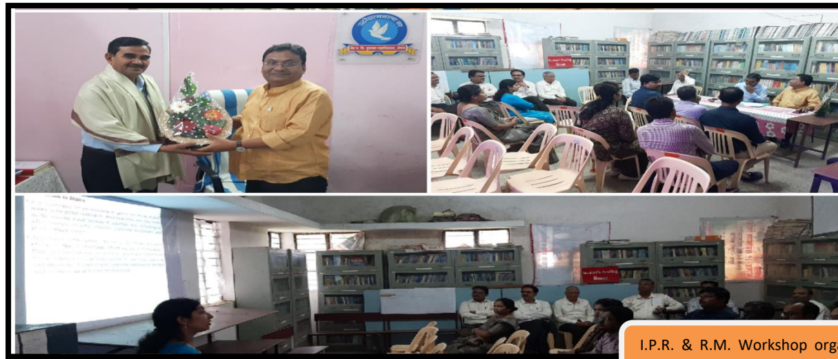
I.P.R. & R.M. Workshop organized by IQAC GBMC ,Shegaon